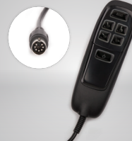
4 73345 Styleline 6 Button Reset Handset Cable