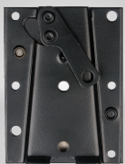
Backrest Bracket - Female LH/RH