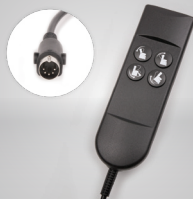
75008 Proline 4 Button