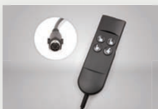
75008 Proline 4 Button