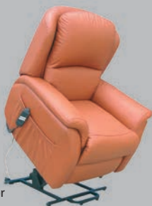
Upholstered mechanism for illustrative purposes.